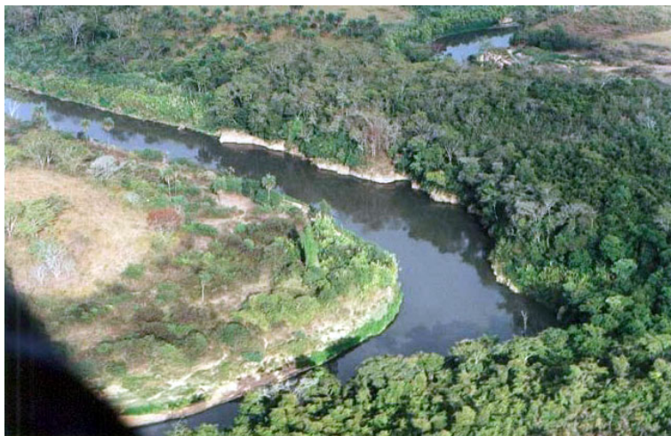
Figure II: Rio das Velhas, Minas Gerais, Brazil. Lacking mainstem or major tributary dams, the Rio das Velhas floods during the rainy season and supports multiple, permanent, off-channel lakes (lagoas) providing reproductive and rearing habitat for aquatic vertebrates.