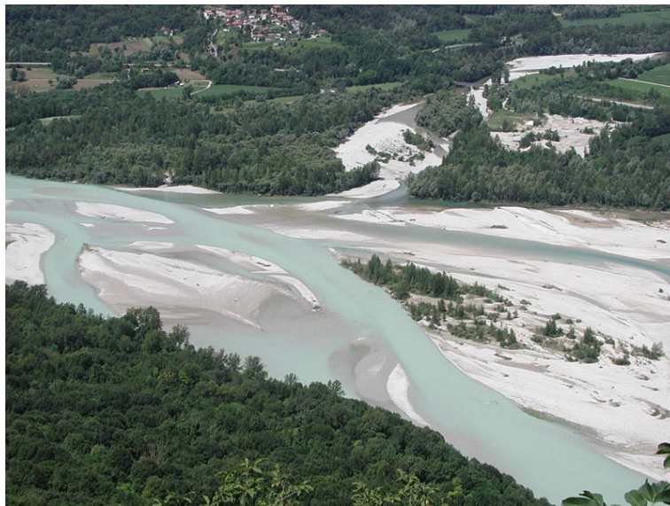
Figure IV: Tagliamento River, Italy. The Tagliamento is one of the largest undammed rivers in western Europe and its braided and anastomosed channels are indicative of high bedload from the Alps.