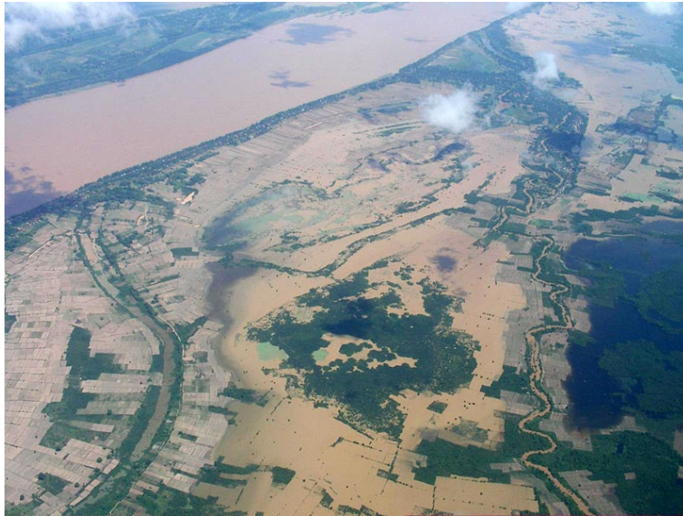
Figure V: Mekong River and its tributary in Cambodia. Photo taken by Seiichi Nohara during the rainy season. The tributary of this floodplain river is visible only because the riparian forest canopy is barely higher than the water level.