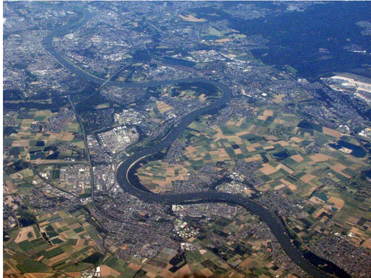
Figure III: Upper Danube River, Germany. This large floodplain river has lost much of its floodplain connectivity as a result of channelization and system-wide dams and locks.