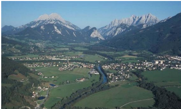
Figure VI: The River Enns, Styria, Austria. Hydropower dams, canals, and channelization limit connectivity of the Enns with its floodplain.