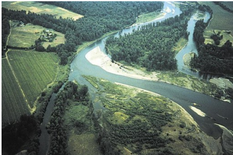
Figure I: The Upper Mainstem Willamette River, Oregon, USA. Despite being channelized in the early 20th century and having multiple hydropower dams in its major tributaries, the upper mainstem of this floodplain river retains channel complexity in the form of side channels, islands, and alcoves.