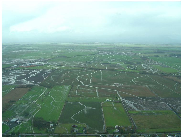
Figure VII: Intermittent tributaries of the Calapooia River, Oregon, USA. Nearly all of the visible channels (agricultural ditches) are only wet during the rainy season, yet they provide overwintering refuge habitat for spawning and rearing native fish, including salmonids.